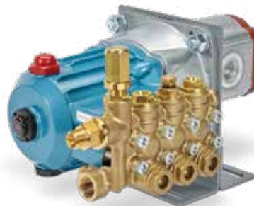
5SP30HUDHYD Assembly shown with 1.15 in 3 motor