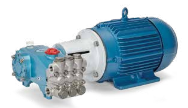
Direct-drive pumps offer high-performance in a small footprint:

Misting and fogging systems are commonly used with chemicals to neutralize odors or manage unwanted insects and other pests. High-pressure misting systems use less water and chemicals than other methods, making them an economical control solution.