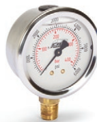
Pressure Gauge PN 6089 0 – 6,000 psi