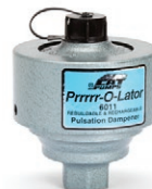
Pulsation Dampener PN 6011 100 – 7,200 psi