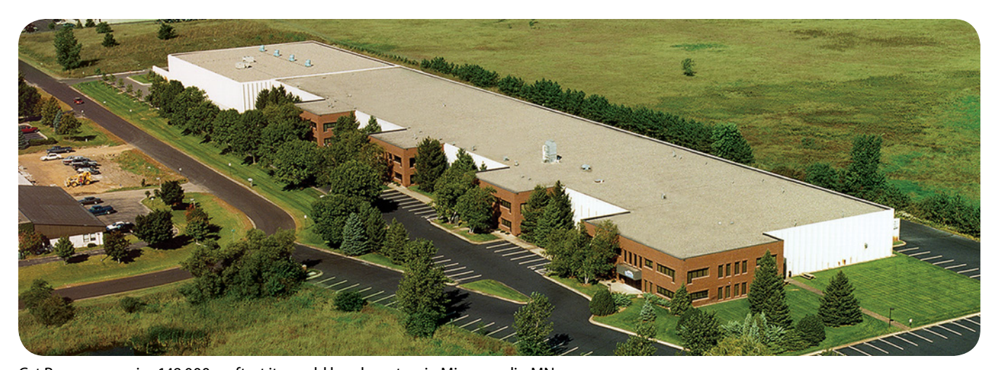
Cat Pumps occupies 149,000 sq. ft. at its world headquarters in Minneapolis, MN.