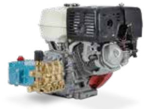
66DX40G1i w/ Engine

Electric Motor Horsepower (HP) = gpm x psi / 1460. For required Engine Horsepower contact engine manufacturer.