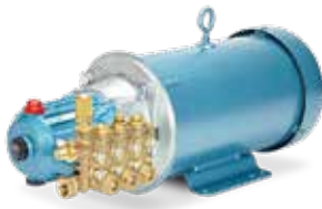
5SP35ELU w/ Electric Motor

Electric Motor Horsepower (HP) = gpm x psi / 1460