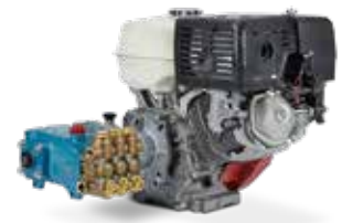
5CP3120CSSG1 w/ Engine

Electric Motor Horsepower (HP) = gpm x psi / 1460. For required Engine Horsepower contact engine manufacturer.