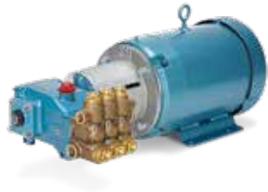
SCP3120CSS w/ Bell Housing, Motor