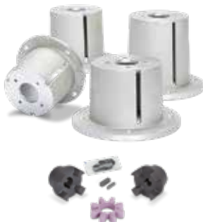
Bell Housing / Flex Coupling

Electric Motor Horsepower (HP) = gpm x psi / 1460