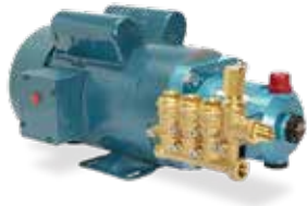
4DX10ER w/ Electric Motor