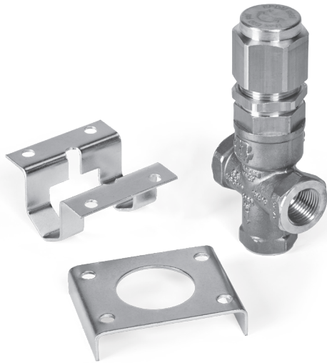
(Panel bracket assembly sold separately)