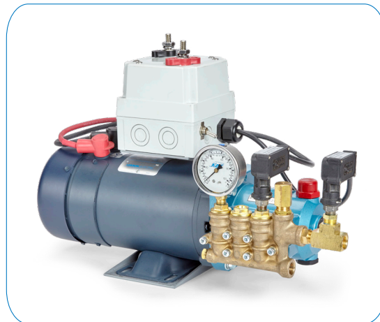
12VAUTO80 Shown with 4DX30EUDC14 pump and motor assembly. Requires tapped valve plug 134670.