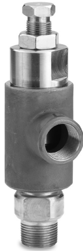
Model 890710 Shown

890710, 890711, 890712, 890714 890703, 890713, 890715