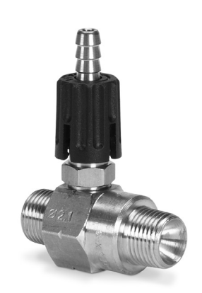
Model 7183 Shown