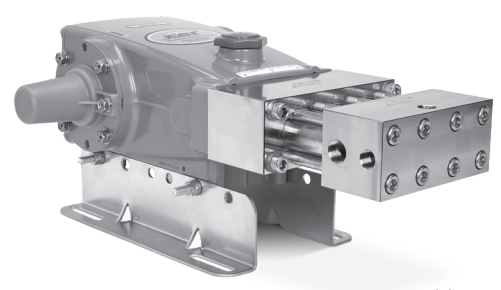
Model 1810 Shown (Mounting rails sold separately)

See Parts List to confirm material compatibility with the fluid pumped before use.