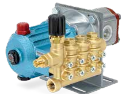
67DXHUDHYD Assembly shown with 0.68 in 3 motor