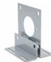
Mounting Assembly PN 76SAEA2.5SP SAE "A" 2-Bolt

Contact Cat Pumps for pricing or more information at info@catpumps.com or (763) 780-5440