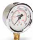
Pressure Gauge PN 6089 0–6,000 psi